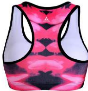
ART# HT-FW-4 03